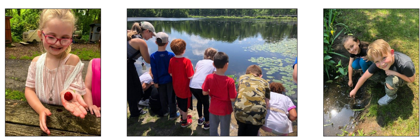
WEST DEPTFORD SCHOOL DISTRICT ...Meeting The Challenge

The end of the school year is always bittersweet, but our Red Bank students will be jumping into summer with so many wonderful memories and an abundance of new friendships.